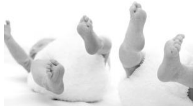
Some twins, yesterday